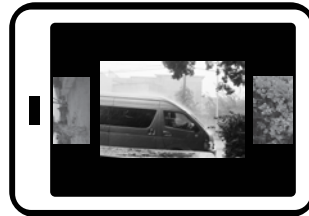
Digital Scan File